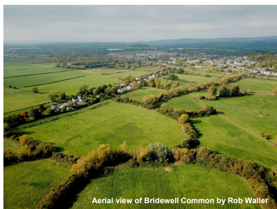
Aerial view of Bridewell Common by Rob Waller

What is Lottery for Wildlife all about? Each entry into Lottery for Wildlife costs £1 each month. This £1 earns you a place in the Lottery for Wildlife draw, held at the end of each month. The lucky winner will receive 30% of the income for that month. The remaining 70% goes towards our conservation work. Over the last 10 years, Gwent Wildlife Trust's Lottery for Wildlife has raised over £17,000 for local wildlife and we've given out over £6,500 in prizes.