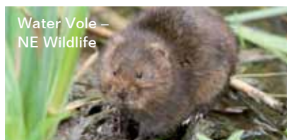
Water Vole

Notice is hereby given that the approval of the resolution to expand GWT Council will lead to vacancies at trustee level. GWT Council welcomes applications from GWT members wishing to serve as trustees, particularly those with legal, fundraising and land management skills to offer as governance in support of GWT. Interested parties are requested to contact the GWT Honorary Secretary in writing at Seddon House in the first instance. There will be a selection process managed by GWT Council.