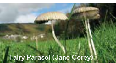
Fairy Parasol

GWT Council will give consideration to the skills and qualities which are particularly sought to provide the best balance to the Trust's governing Council. The Chairman, Hon Secretary and Chief Executive would be pleased to discuss this with any members interested in becoming a trustee. Please contact the Secretary at the Trust Office in writing by 31st August 2015.