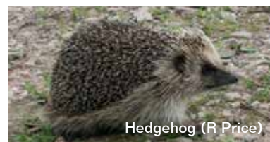
Hedgehog (R Price)