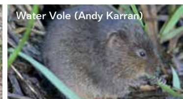
Water Vole