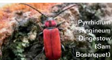
Pyrrhidium sanguineum Dingestow

GWT Council will give consideration to the skills and qualities which are particularly sought to provide the best balance to the Trust's governing Council. The Chairman, Hon Secretary and Chief Executive would be pleased to discuss this with any members interested in becoming a trustee. Please contact the Secretary at the Trust Office in writing by 31st August 2014.