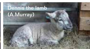
Dennis the lamb