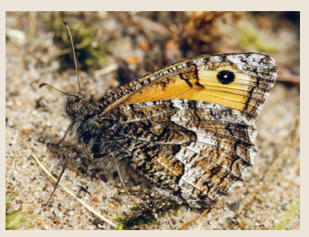
Grayling Butterfly at The British

Through the Living Levels Scheme we produced an outstanding Learning Resource for Teachers based around the history and wildlife of the Gwent Levels. This supports curriculum-linked local learning with our INSET courses for Teachers and received highly positive feedback.