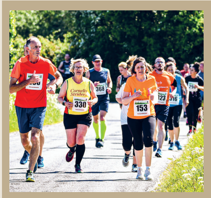
Race for Wildlife – hundreds enjoyed our annual race day on the Levels, which this year contributed over £5,000 towards the Bridewell Common Appeal.

We continued to influence the management of other important sites for wildlife including orchard and field ditch restoration on the Gwent Levels and ongoing surveys of potential local wildlife sites.