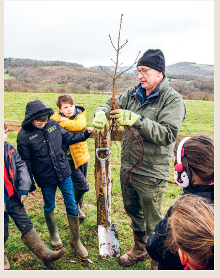
Planting the potential veteran trees of the future at Wyeswood Common Nature Reserve, a collaboration with Cardiff University's Phoenix Project and help from Trellech Primary schoolchildren.