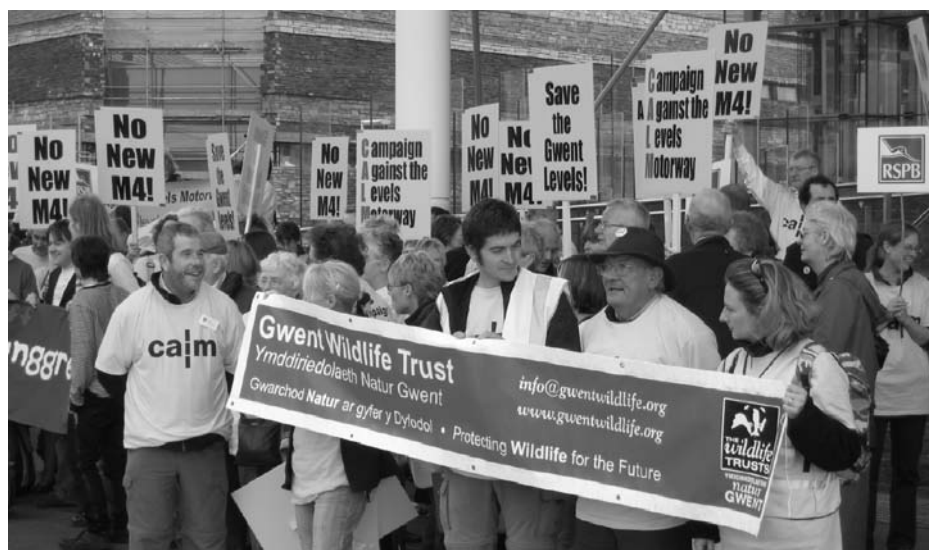
CALM protest in front of the Welsh Assembly Senedd.

Here at Gwent Wildlife Trust, we've always been known as a voice for wildlife. We raise awareness of local biodiversity, respond to planning applications, talk with politicians and campaign on the issues that threaten wildlife.