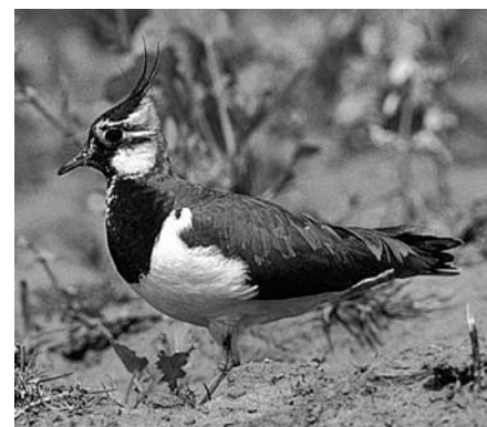
Legacy income is directly benefitting lapwing at Magor Marsh.