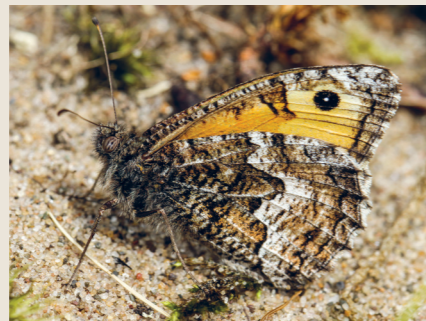
Grayling Butterfly at The British

Through the Living Levels Scheme we produced an outstanding Learning Resource for Teachers based around the history and wildlife of the Gwent Levels. This supports curriculum-linked local learning with our INSET courses for Teachers and received highly positive feedback.