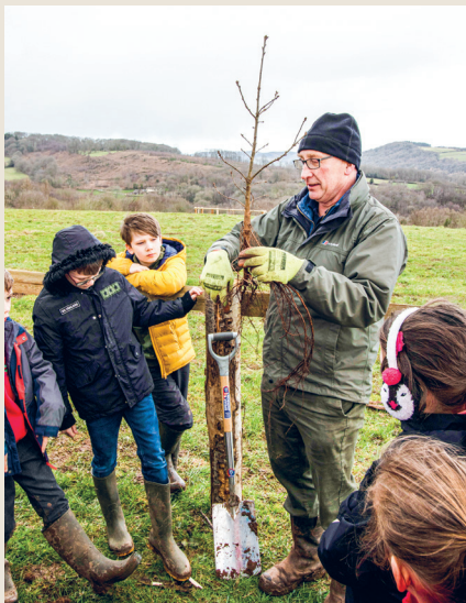
Planting the potential veteran trees of the future at Wyeswood Common Nature Reserve, a collaboration with Cardiff University's Phoenix Project and help from Trellech Primary schoolchildren.