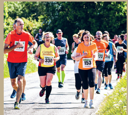
Race for Wildlife – hundreds enjoyed our annual race day on the Levels, which this year contributed over £5,000 towards the Bridewell Common Appeal.

We continued to influence the management of other important sites for wildlife including orchard and field ditch restoration on the Gwent Levels and ongoing surveys of potential local wildlife sites.