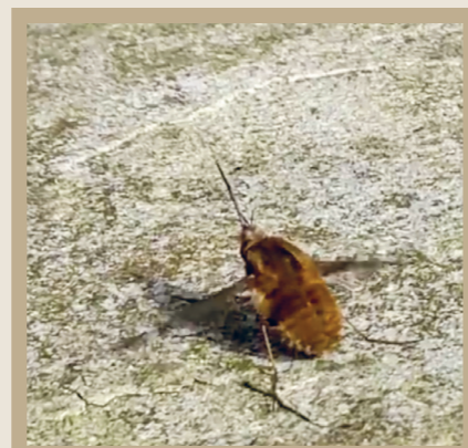
Our amazing video footage of a Dark Edged Bee-fly as it was getting ready to fly was seen 65,598 times on our Social Media pages!