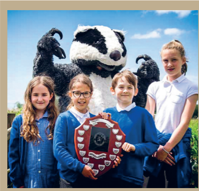
Our Wildlife Wizards quiz saw 25 schools, a record number, take part: Shirenewton Primary were the wise winners.

281 people participated in over 30 formal training programmes and events