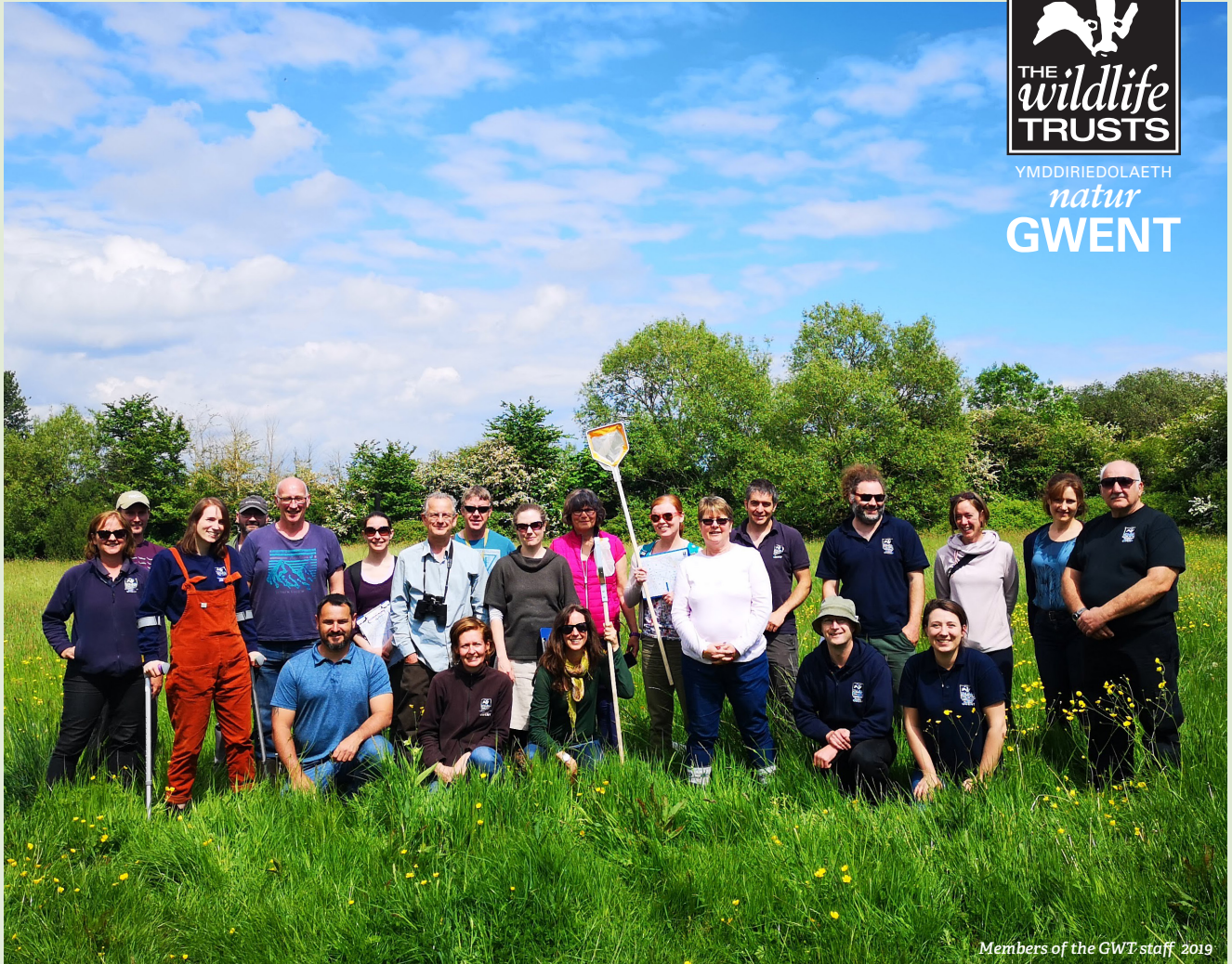
Members of the GWT staff 2019

Gwent Wildlife Trust // Ymddiriedolaeth Natur Gwent